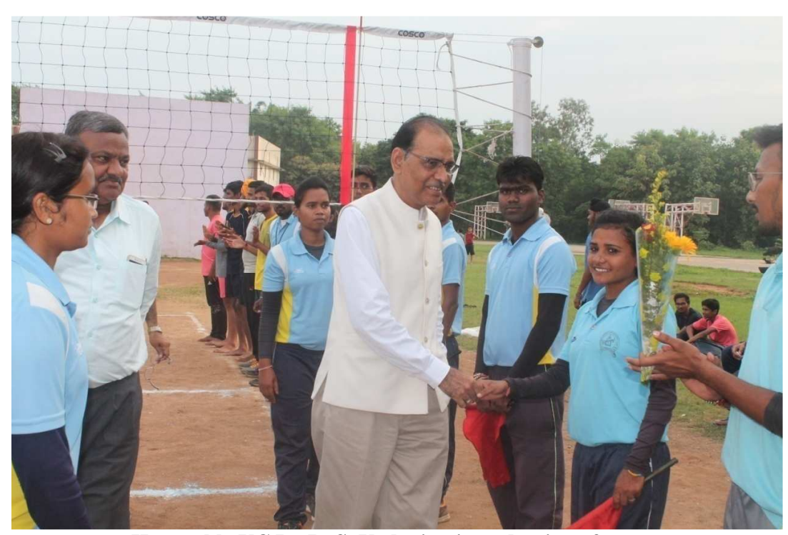
Honorable VC Pt .R. S. U. during introduction of teams