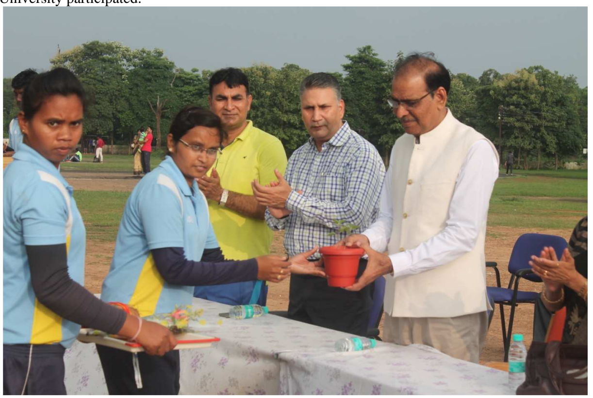
Honorable VC Pt .R. S. U. during inauguration of National Sports Day Celebration on 29/08/2018

National Sports day was organized by SOSPE on 29/08/2018. Honorable Vice Chancellor, Pt. R. S. U. inaugurated the celebration. Twelve teams in "Boys" category and eight teams in "Girls" category from different colleges affiliated to Pt. R. S. U. & Hemchand Yadav University participated.