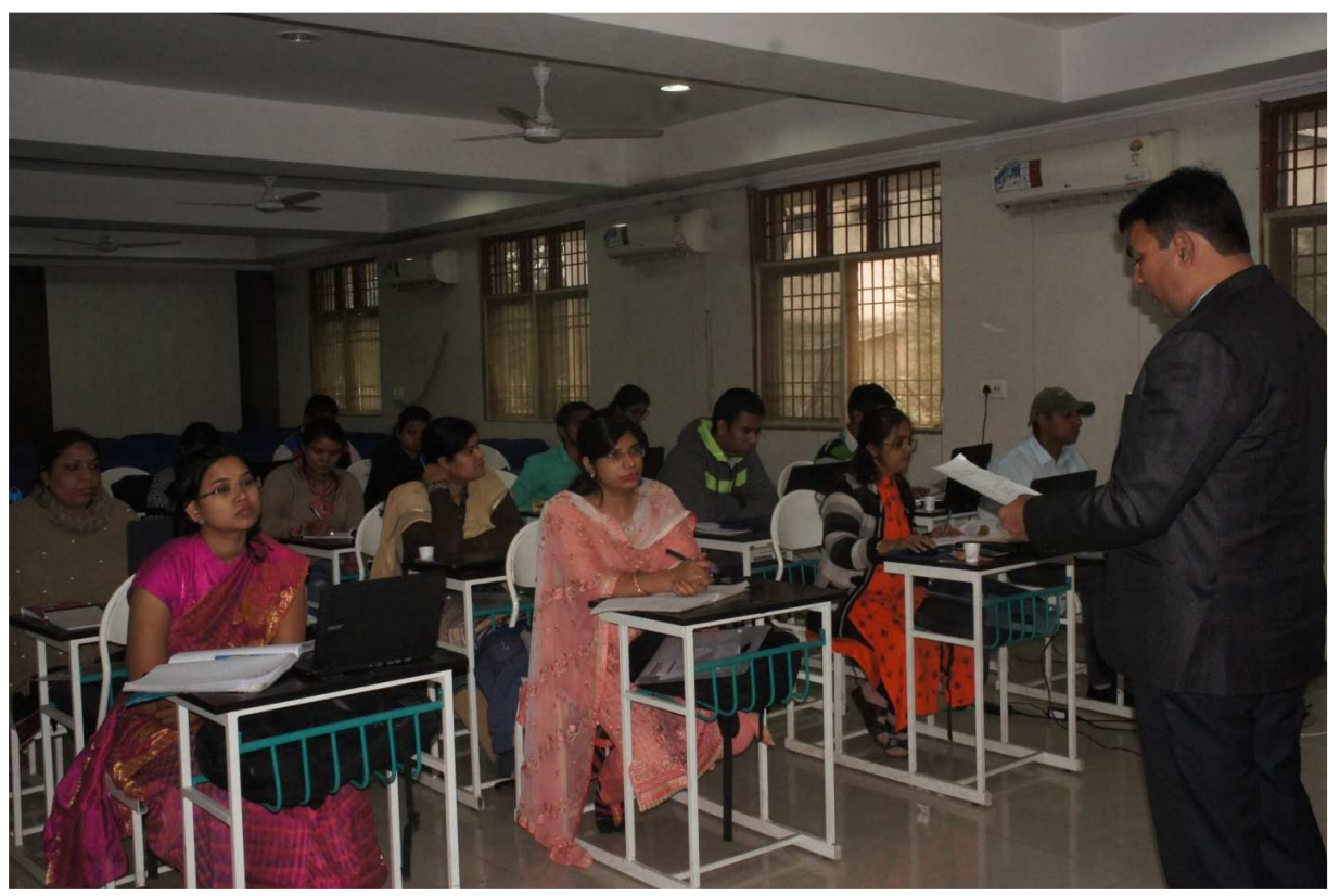
Session during Workshop

Overall Satisfaction of participants on the basis of feedback (2nd One day workshop on Data Analysis, November 16, 2018)