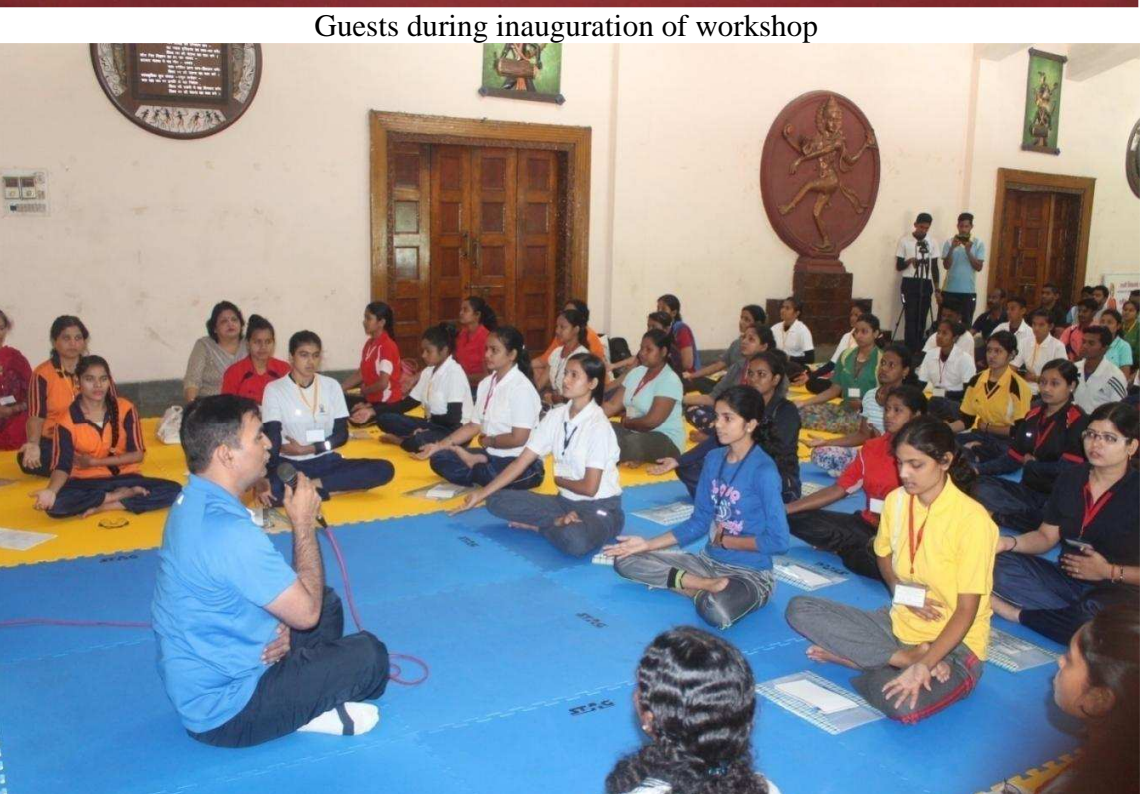
Yogic Session during workshop