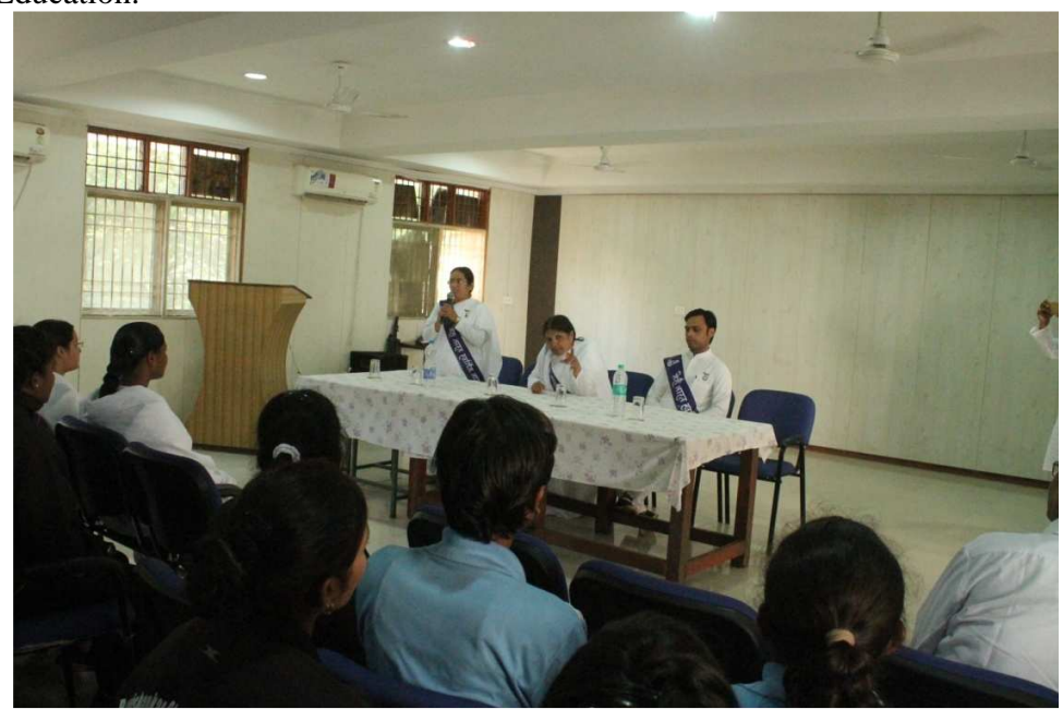
Lecture on Spirituality by BKS

Talk on spirituality On 13<sup>th</sup> November, experts of BKS delivered a talk on spirituality in School of Studies in Physical Education.