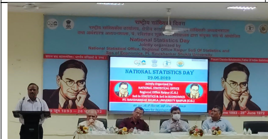
17 th National Statistics Day, 2023