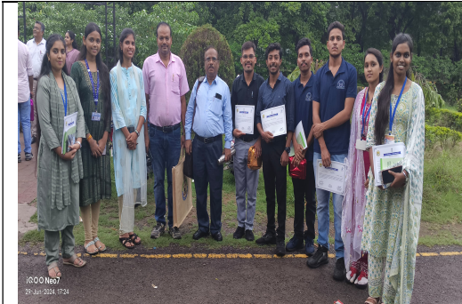
18 th National Statistics Day, 2023