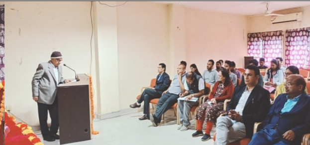
Public Outreach Lecture, 2023