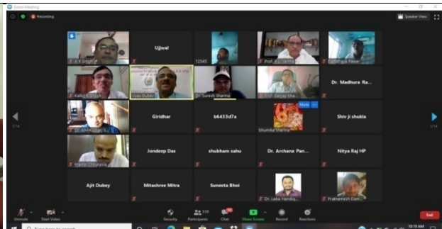
Online National Workshop, 2020