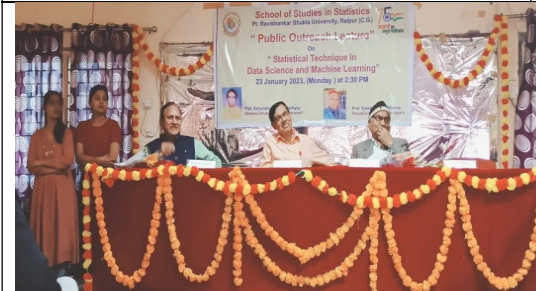
Public Outreach Lecture, 2023