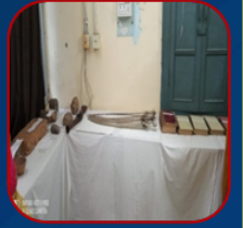
Museum and Archives Room