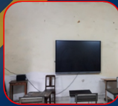
Furnished and Smart classrooms