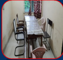
Research Scholars Room