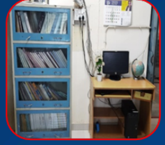
Computers with Internet