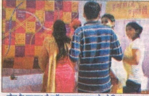
खेल के माध्यम से स्टॉल लगाकर युवाओं को किया जागरूक