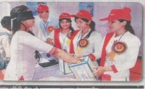
रोटी बनाना ही औरत का काम नहीं

शुभपुर। 'आईएसएस' के कार्यक्रमों में भाग लेने वाले युवाओं को बताया कि आज के समाज में लिंग के आधार पर भेदभाव, भ्रष्टाचार, अंधकार और सम्मान का निर्धारण होता है। समाज में लड़कियां, लड़कियों या बेटों जैसी कोई संकेतक अभावपूर्ण नहीं हुई कि वे लड़की है। लड़की को कम माना जाता है। अंधकार समाज में फैलने से ही भेदभाव है, जो लिंग के आधार पर लड़कियों के कम की बात नहीं, बल्कि यह बात है कि वे लिंग से बेरुख हैं। रोटी पकाना लड़कियों के कम की बात नहीं, हाथ अगम्य को लड़कियों के साथ काम करती है, न आदमी में शामिल है न और न में अर्द्ध। लिंग के आधार पर लड़कियों को पारंपरिक, पारंपरिक या अंधविश्वास का अंधकारन कर चलते हैं। यह बात खेल एवं युवा कल्याण विभाग के सचिव