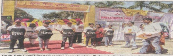
Youth Fair (Just Gender) jointly organised by Oxfam India, Women' Study Centre (Pandit Ravishankar University) and State Resource Centre (Adult and Continuing Education)